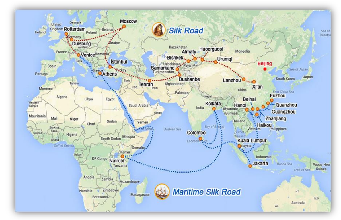
Image 1. The New Silk Road Routes on land and sea.

Image 2. The Eurasian Rail Network (Lines for the proposed Chinese Transcontinental network and for the Chinese Land Bridge, Blue and Red line respectively).