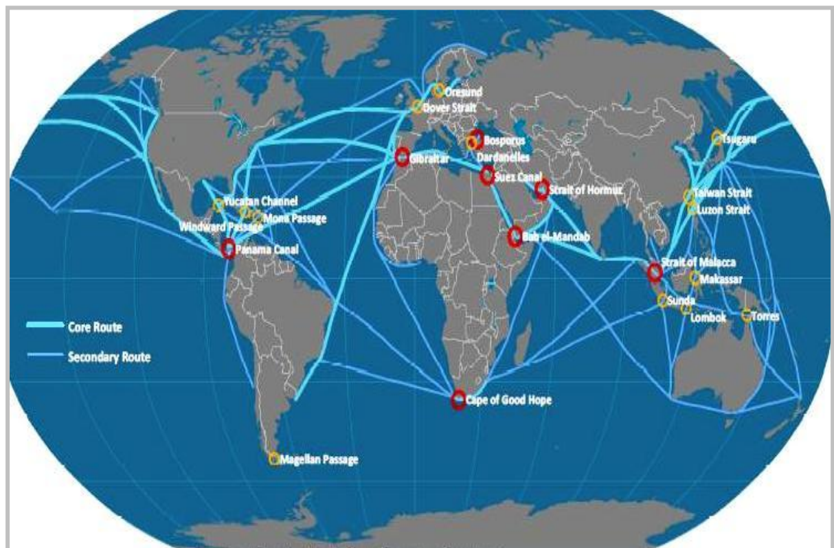
Figure 1: Major transport routes and the role of the Mediterranean Sea

The Med's geo-economic significance is made clearly obvious by the fact that it is a common area for three different continents: Europe, Asia and Africa. Furthermore, it is necessary to note that there are two very important sea straits in its eastern basin: The first one is the Dardanelles, through which the Mediterranean Sea (and the Aegean Sea) communicate with the Black Sea and the various countries whose coastlines are located on the wider region of Black Sea; of course, for the latter the access to the open (warm) seas is secured. The second gate of interest is the Suez Canal. Subsequently, the following two basic axes with special importance for maritime transports are formed: a) Atlantic Ocean-Mediterranean Sea-Red Sea and b) Black Sea-Aegean Sea-Mediterranean Sea-Indian Ocean. As a result, the Mediterranean is often characterised as an extremely important element of the modern maritime transport system and, above all, as the most important link of the transport chain between Asia and Europe (see figure 1)