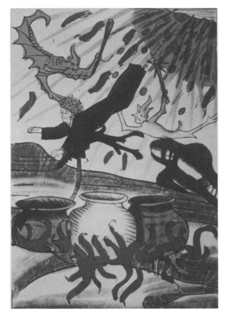
Figure 3: Devils lead Antichrist to Hell, with the representation of fire and brimstone. Reproduced from Buch von dem Entkrist, colored woodcuts, mid-fifteenth century.

There were two main varieties of chiliasm in the Middle Ages: the "post-Antichrist" and the "pre-Antichrist" strains. <sup>14</sup> The former was more grounded in tra-