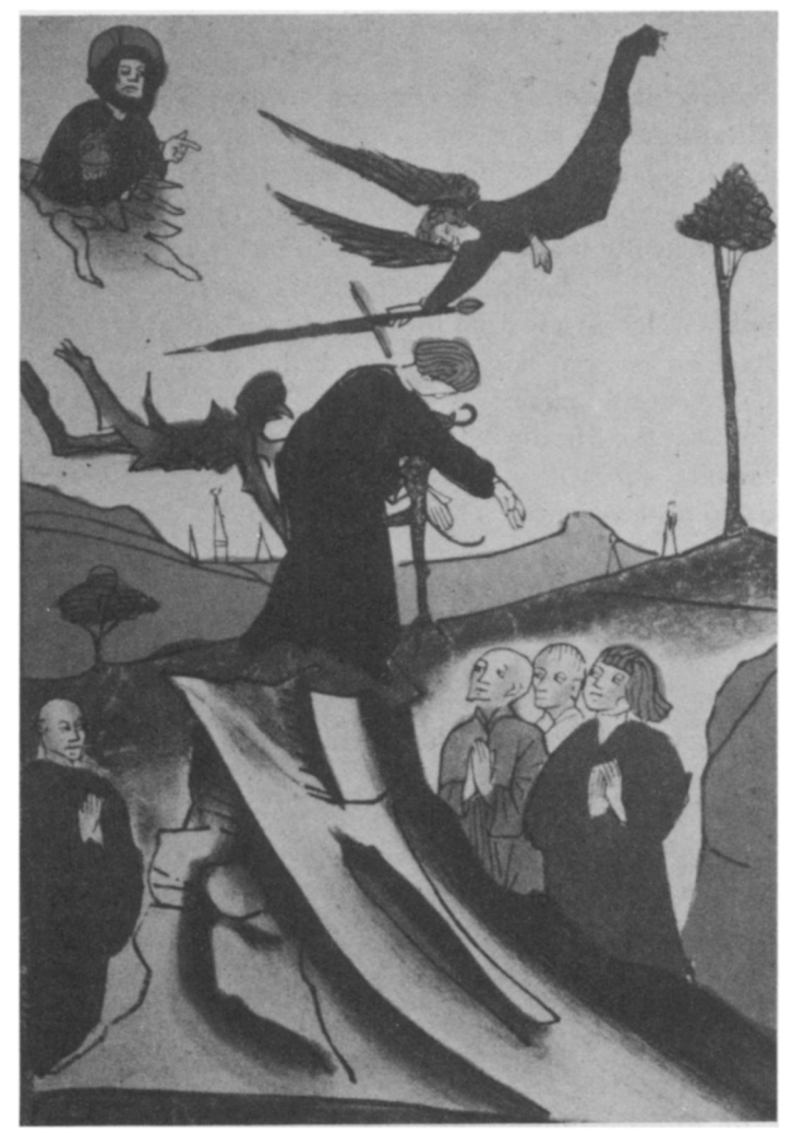
Figure 2: Antichrist calls up devils to take over the world, and Archangel Michael descends to smite him. Reproduced from Buch von dem Entkrist, colored woodcuts, mid-fifteenth century.

can also encourage perseverance in the face of persecution and bring hope in the face of trials.<sup>13</sup>