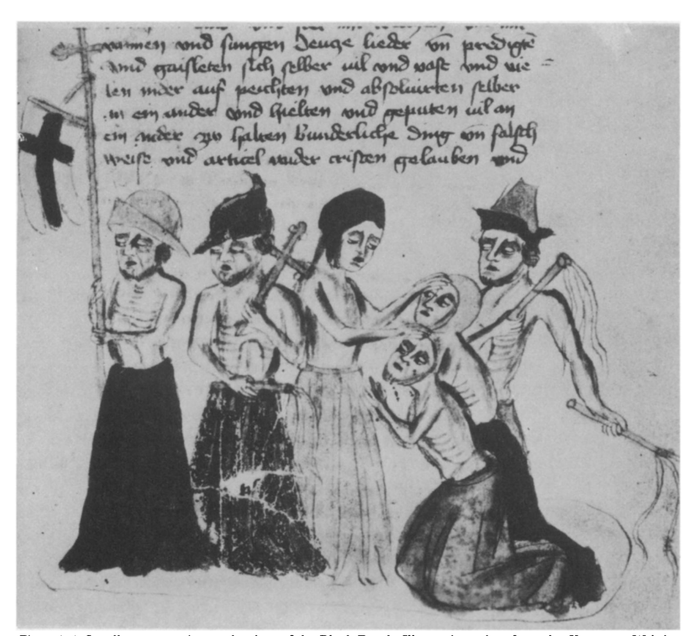
Figure 1: A flagellant procession at the time of the Black Death. Illustration taken from the Konstanzer Weltchronik, third quarter of the fifteenth century, Bavaria; Munich, Bayerische Staatsbibliothek, MS Cgm 426, f. 42v.