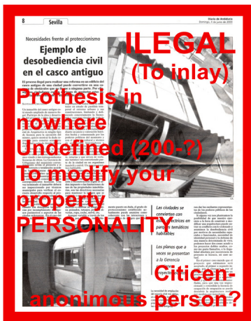
Fig. 3: Santiago Cirugeda's Strategies for Subversive Urban Occupation (from left to right and top to bottom): Skips - Taking the street; Scaffolding - Building yourself an urban reserve; Insect House - The tick's stratagem; Puzzle House - The closet stratagem; Housing: Pepe's house - Civil Disobedience (copyright Santiago Cirugeda/Recetas Urbanas)