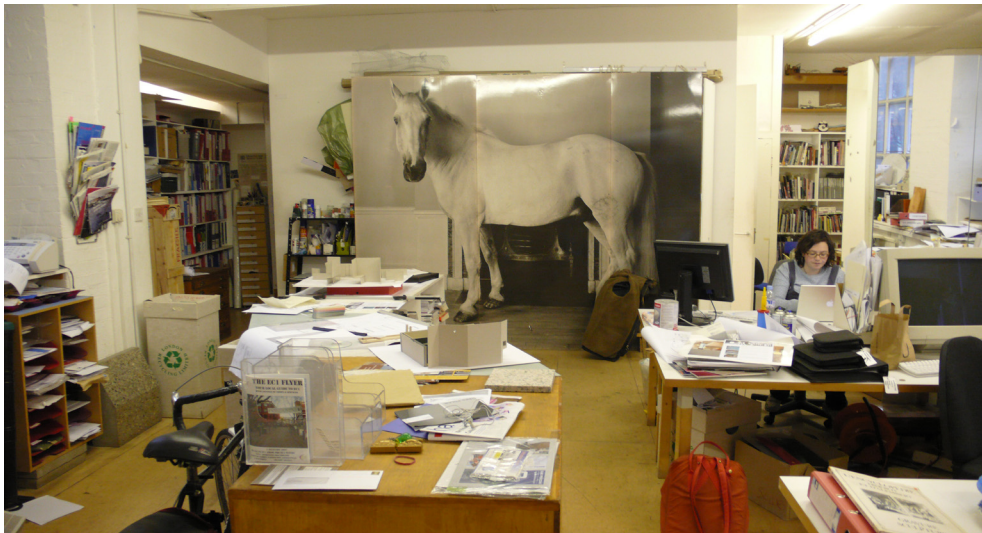
Fig. 1: muf offices, London