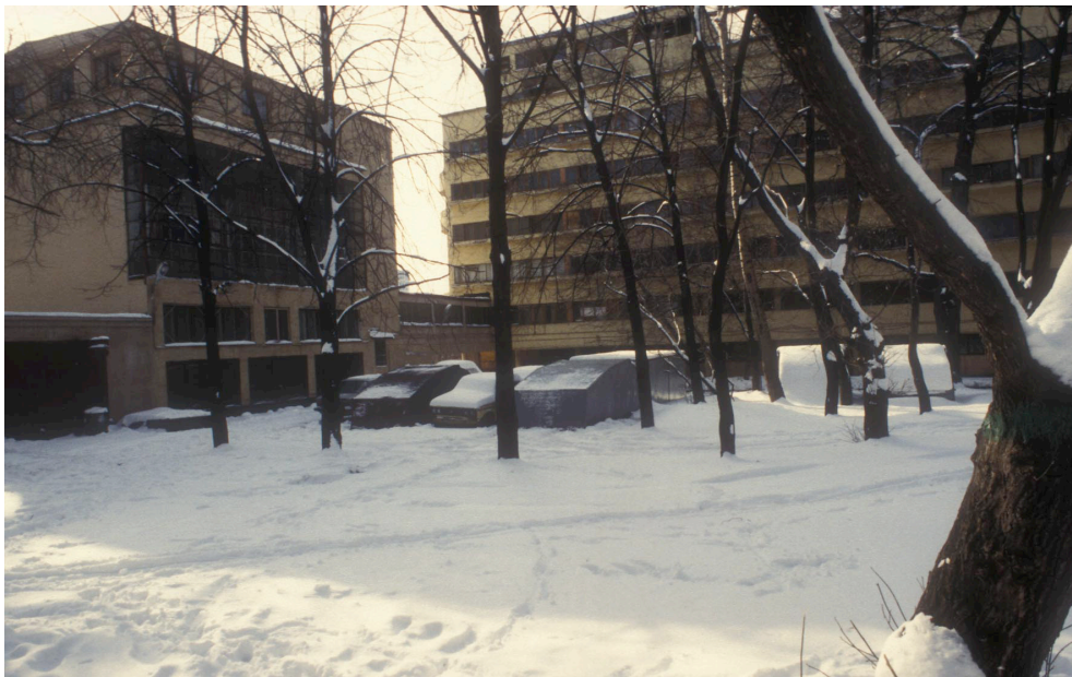
Fig. 2: Narkomfin Housing Project in 1997: Communal eating hall, nursery and launderette in the wing on the left