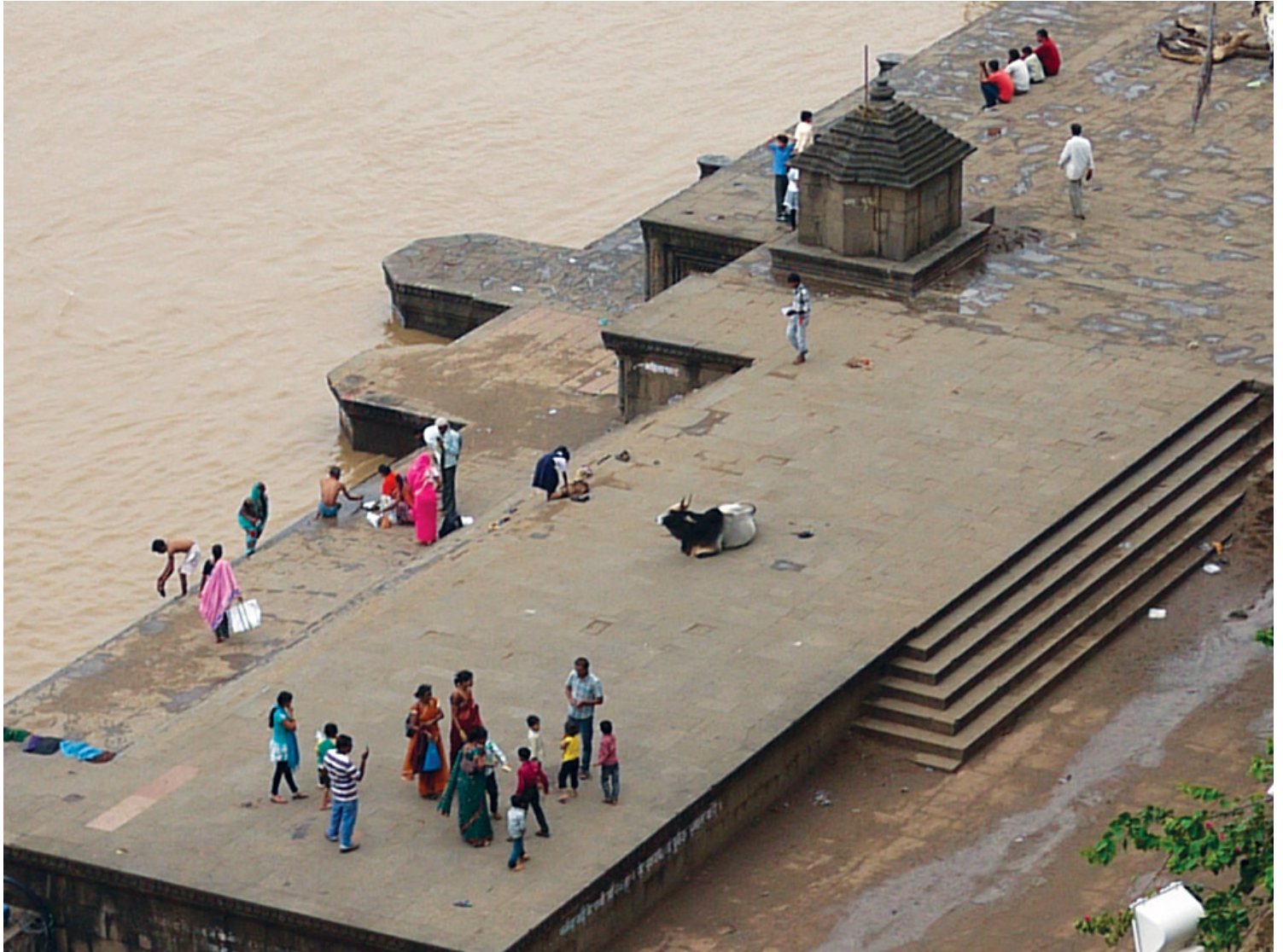
Ahilya Fort on the Narmada River, Maheswar, India. Ghats details.

Floods, River Dynamics and Climate Change in Urban Public Space https://urbannext.net/floods-river-dynamics-and-climate-change/