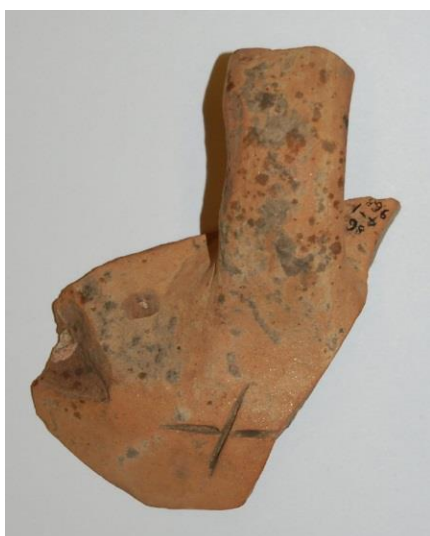
Figure 3. A wide variety of foodstuffs and other commodities could be transported in pottery amphorae: traces of figs were discovered on this fragment of a 6th century BC Ionian amphora from Naukratis (see Stacey et al. 2010). British Museum, 1886,0401.968

Who was the trade aimed at? Some of the goods that went from the Mediterranean to Naukratis and beyond may well have been intended to supply foreigners in Egypt – such as the foreign mercenaries dotted around the country. But there was also clearly a genuine flow of goods and commodities destined for local Egyptian consumption.