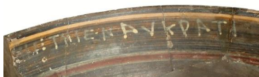
Figure 13. North Ionian large bowl with a painted inscription (dipinto) on the inside naming ‘Aphrodite at Naukratis’ [ο[...]: τῆς ἐν Ναυκρατί], c. 575–550 BC. British Museum, 1888,0601.531.

To date it has proved difficult to thoroughly assess these arguments with the help of the site’s archaeology, which remained poorly understood particularly as far as Egyptian evidence is concerned. Hardly any of the once abundant Egyptian pottery survived the early excavator’s find selection (see below). A small number of securely dated and inscribed finds of Saite or even earlier date were assembled and discussed by Jean Yoyotte (Yoyotte 1991/2; 1993/4, 1994/5; cf. Leclère 2008, 116–19; Agut-Labordère 2012) as part of his case for an early Egyptian presence at the site, but the vast majority of surviving Egyptian finds remained barely