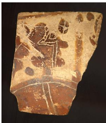
Figure 6. Fragment from Early Corinthian black figure aryballos from Naukratis, c. 620–590 BC. Ashmolean Museum, Oxford, 1896-1908 G.120.30.