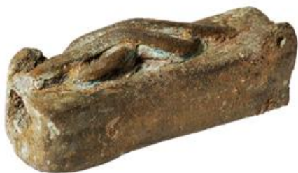
Figure 14. Small bronze relic box or coffin of a snake from Naukratis, once containing parts of a dead snake, decorated with a coiled snake on the top, date unknown. Bolton Museum, 1886.31.69.b.