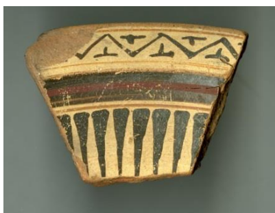
Figure 7. Fragment from rim of Milesian plate from Naukratis, late 7th–early 6th century BC. British Museum, 1888,0601.544.f

One of the main results that emerged from Petrie's fieldwork at Naukratis was an earlier date for the foundation of the site than had previously been assumed. As Petrie realized after the first season's fieldwork, Naukratis must date back to the late 7th century BC, not just to the time of Amasis, as one might be tempted to think (though would not necessarily have to conclude) from glancing at Herodotus. Even though Petrie's dating of the site was by no means immediately or universally accepted (Hirschfeld 1887; cf. see Leonard 1997, 17–19) and still remains debated (esp. James 2003, 2005; cf. also Bowden 1986, 26–8; Agut-Labordère 2012, 360 with n. 19; Lloyd 1975–88, vol. 3, 222–4), a pre-Amasis date of the foundation is today commonly accepted. Historically, it certainly makes sense if seen against the background of Psamtek (Psammetichos) I's Greek and Carian mercenaries and the military support he received from the Kingdom of Lydia, in the hinterland of the Ionian cities in the late 7th century BC (Fantalkin 2014). Most importantly, however, such a date is supported by historical dates for Archaic Greek pottery in archaeological contexts in the Levant (e.g. Stager et al. 2011; discussed in detail by Schlotzhauer 2012), which independently confirm a (late) 7th century dating for the earliest pottery finds from Naukratis (Figs 6 and 7).