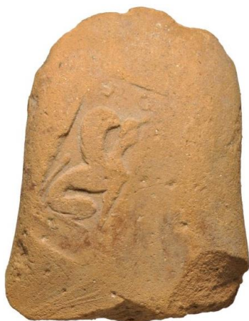
Figure 10. Fragment of a handle from a Thasian transport amphora with a stamp of a seated sphinx, 380–360 BC. British Museum, 1955,0920.62

designates its owner as a Greek (Yoyotte 1994–5, 672–3; Agut-Labordère 2012, 369).