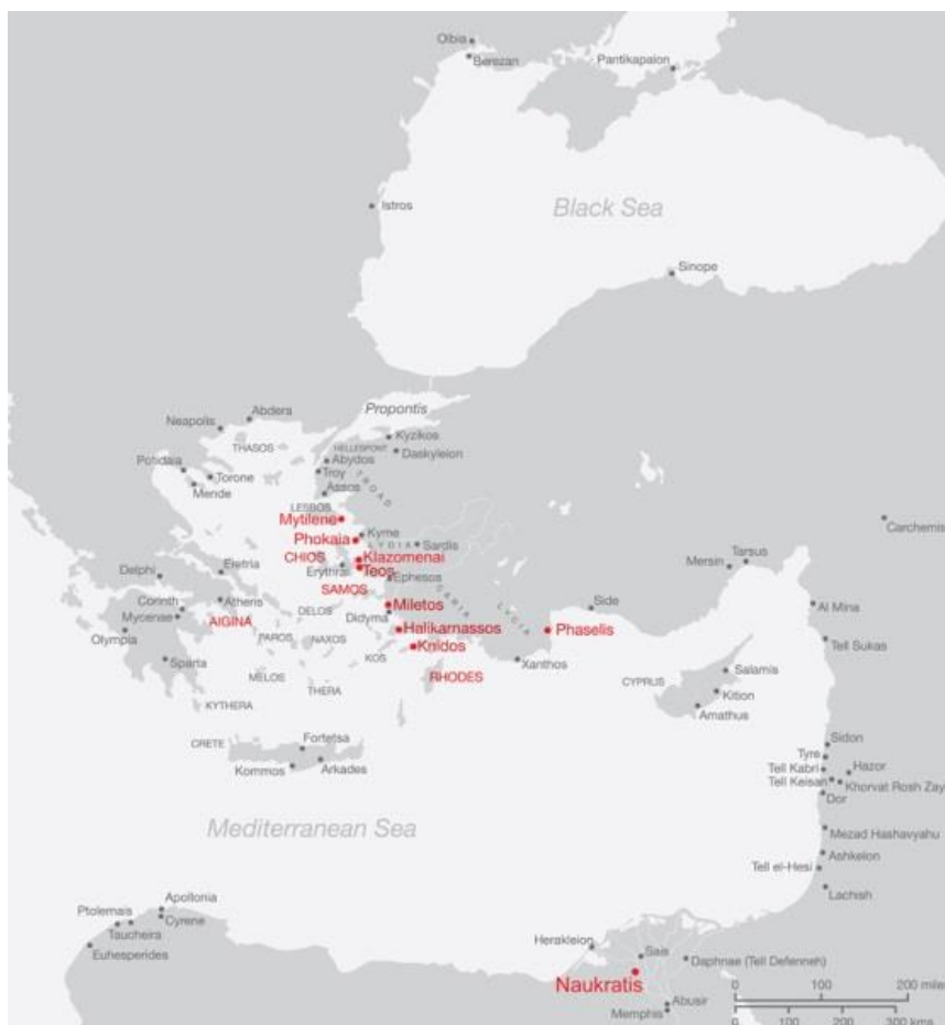
Figure 1. Map of the Eastern Mediterranean showing Naukratis and its founding cities.