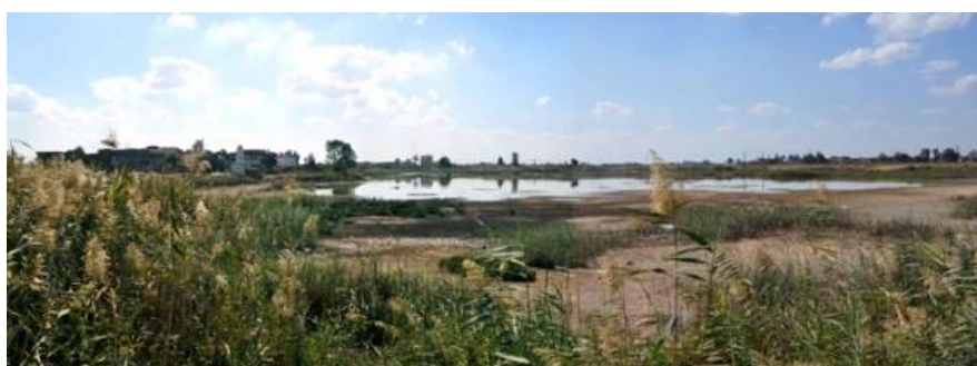
Figure 2. The site of Naukratis in 2011, looking south over the partly dried-up lake now covering much of the central part of the ancient town.

For anyone reading this description, seeing the remains of the site today (Fig. 2) presents a severe challenge to the imagination: with no visible signs of ancient ruins and in a remote, rural location, it is hard to imagine that this was once the busy, thriving port city that Herodotus describes.