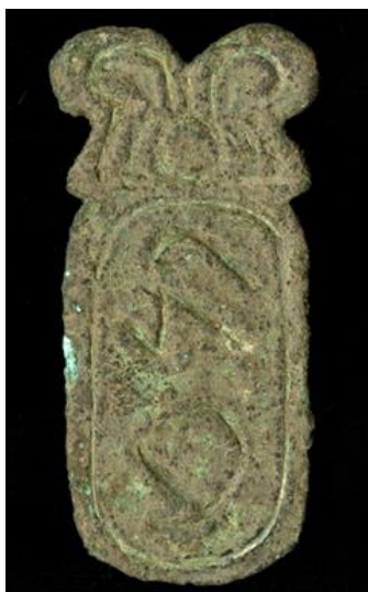
Figure 4. Bronze stamp seal of the Persian period with the name of an official in Aramaic, which may have been used e.g. for stamping the mud sealings of amphorae. British Museum, 1886,0401.1706