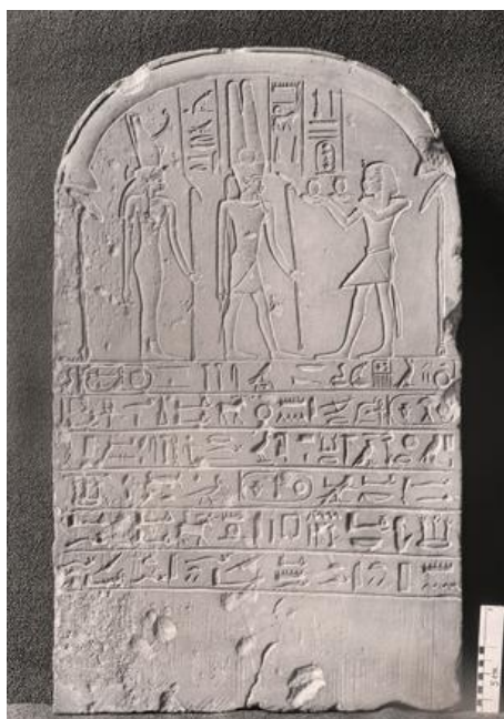
Figure 12. Donation stele for Amun-Re Baded, reign of Apries (589-570 BC). Berlin, Ägyptisches Museum und Papyrussammlung. Inv.-Nr. ÄM 7780.

foundation on ‘virgin soil’ (e.g. Möller 2000a, 118–19: ‘Naukratis was a purely Greek empóron , the assumption of an Egyptian quarter being based on misinterpretation’; see also Möller 2001a, 5–11), and Egyptologists an earlier Egyptian presence exerting firm control over the foreign settlers (cf. Yoyotte 1993/4; Leclère 2008, 113–47, esp. 121: ‘C’est au nord de ce noyau urbain égyptien que s’est développé l’établissement grec’). Relatively little work, however, has to date been done on Egyptian Naukratis and particularly on the Egyptian finds from the site, thus leaving much open to speculation.