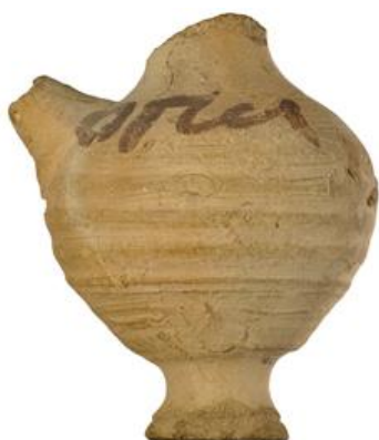
Figure 11. Flask with the Greek ευλογία (blessing, gift or alms) written on the shoulder, possibly a reference to the Eucharist, 6th century AD. British Museum, OA.9431

Naukratis continued to be occupied through the Roman period and well into the Byzantine period at least until the 7th century AD. Imported and local pottery, lamps, glass, coins, jewelry, stamps and seals, games, figurines and sculpture dating from the late 1st century BC to the 7th century AD have been found in all seasons of excavation as well as the survey at Naukratis. The settlement seems to have been in slow decline from the late Ptolemaic period until the 2nd century AD, by which time the geographer Claudius Ptolemy in his Geography (4.5) describes the site as a town, and no longer a city or polis: ‘Sais Nome and metropolis: Sais 61°30’ E 30°30’ N. On the Great river toward the east: Naukratis town 61°15’ E 30°30’ N.’ Naukratis retained some status, however, as games were performed there in the 3rd century AD. They are mentioned in a papyrus document found in Oxyrhynchus that dates from c. AD 226 to 230 (P.Oxy. XXII 2338) that lists victorious poets, trumpeters and heralds at the Naukratis games.