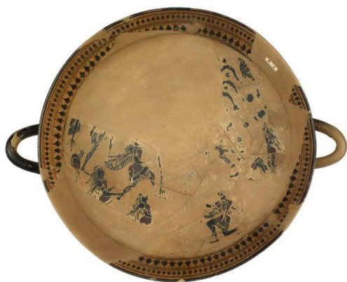
Figure 8. Laconian black figure pottery kylix from the sanctuary of Apollo at Naukratis, 570–560BC. British Museum, 1886,0401.1063