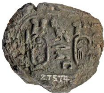
Figure 15. Seal of Amasis-Sa-Neith, a high official at the court of Pharaoh Amasis (570–526BC), found at Naukratis. British Museum, 27574

studied (for bronzes see recently Weiss 2012, 442-6). All this resulted in a picture of Naukratis that was heavily biased towards the Greek. It is only now as part of the present project that the Egyptian material from early fieldwork at Naukratis has been fully catalogued, and that the size and significance of the Egyptian element in the site's material culture can be appreciated (Figs 14 and 15).