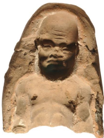
Figure 5. Fragment of Ptolemaic mould for terracotta figurines of an old man, 2nd–1st century BC. British Museum, 1886,0401.1542