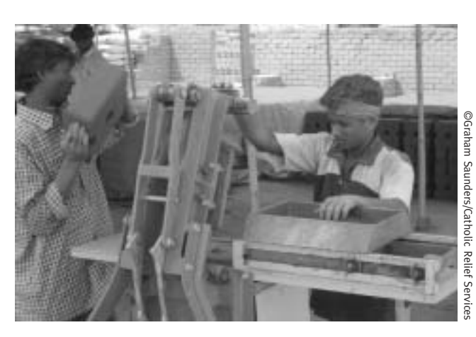
Compressed earth bricks being produced in Gujarat

The housing units met the government's earthquake-resistance standards, were in keeping with the local housing style and allowed families to tailor houses to their individual needs, creating a diverse and more interesting living environment. Village committees identified beneficiaries, and administrative and financial systems to facilitate procurement of materials and logistical procedures were established.<sup>32</sup>