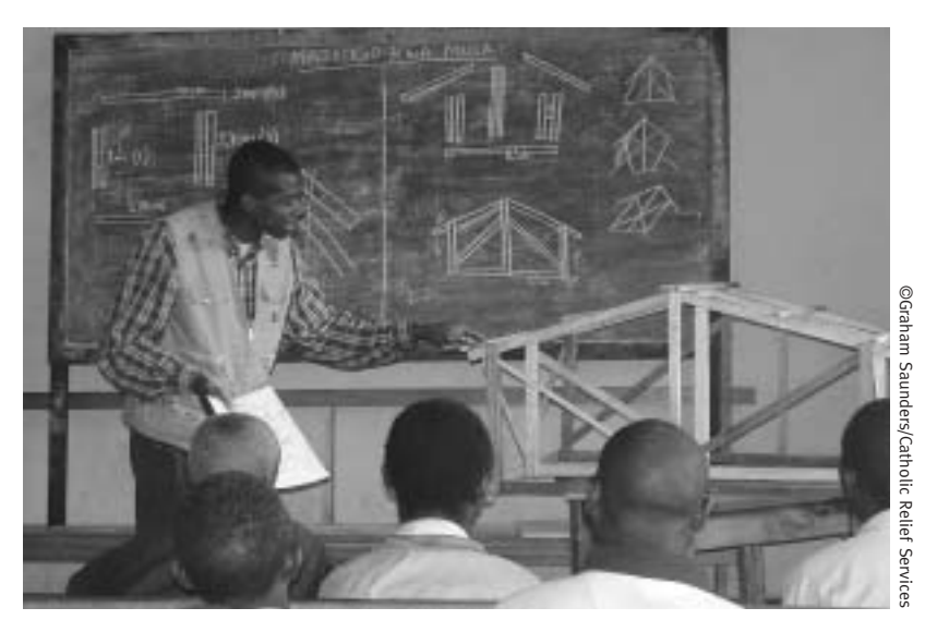
In Goma, technical advice enabled local people to rebuild their homes

ones) need to establish themselves locally. They should also anticipate the difficulties contractors are going to face in terms of procuring building expertise and materials. The potential pitfalls of an unrealistic and overly ambitious contracting approach are illustrated clearly by the Yemeni case study in Box 25, where construction was still in progress over a decade after the original earthquake.