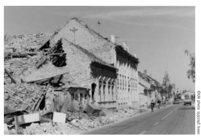
War-damaged homes, Vukovar, Croatia, September 1992

Why, if housing destruction is such a major consequence of disasters and conflict, is its reconstruction such a poor relation in the relief aid enterprise? Part of the answer lies in the way that assistance is understood, funded and organised. Housing reconstruction is often construed as a developmental responsibility rather than properly a humanitarian concern, and consequently tends to be low