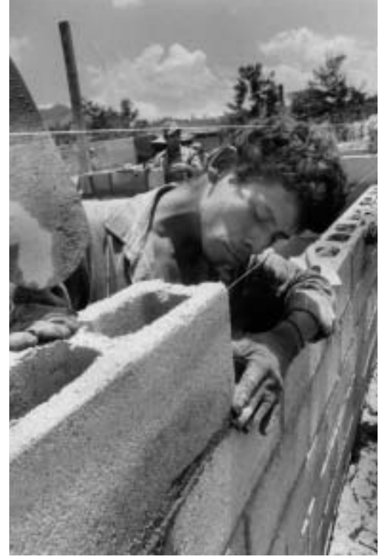
Local capacity can be crucial: here, local people in San Juan, Nicaragua, rebuild their homes after Hurricane Mitch

Because the local community can make a vital contribution to housing reconstruction, an assessment of local resources is essential. This must not be limited to financial assets, but should consider all the major inputs required for the successful implementation of a housing project: human resources (skilled and unskilled labour); institutional resources; community resources; building materials; and technology. Broadly speaking, the more resources that are available locally, the fewer