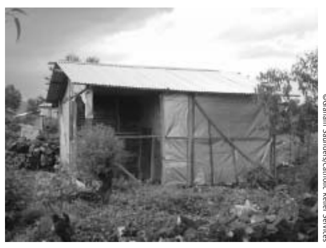
Transitional units erected following the Goma eruption in 2002